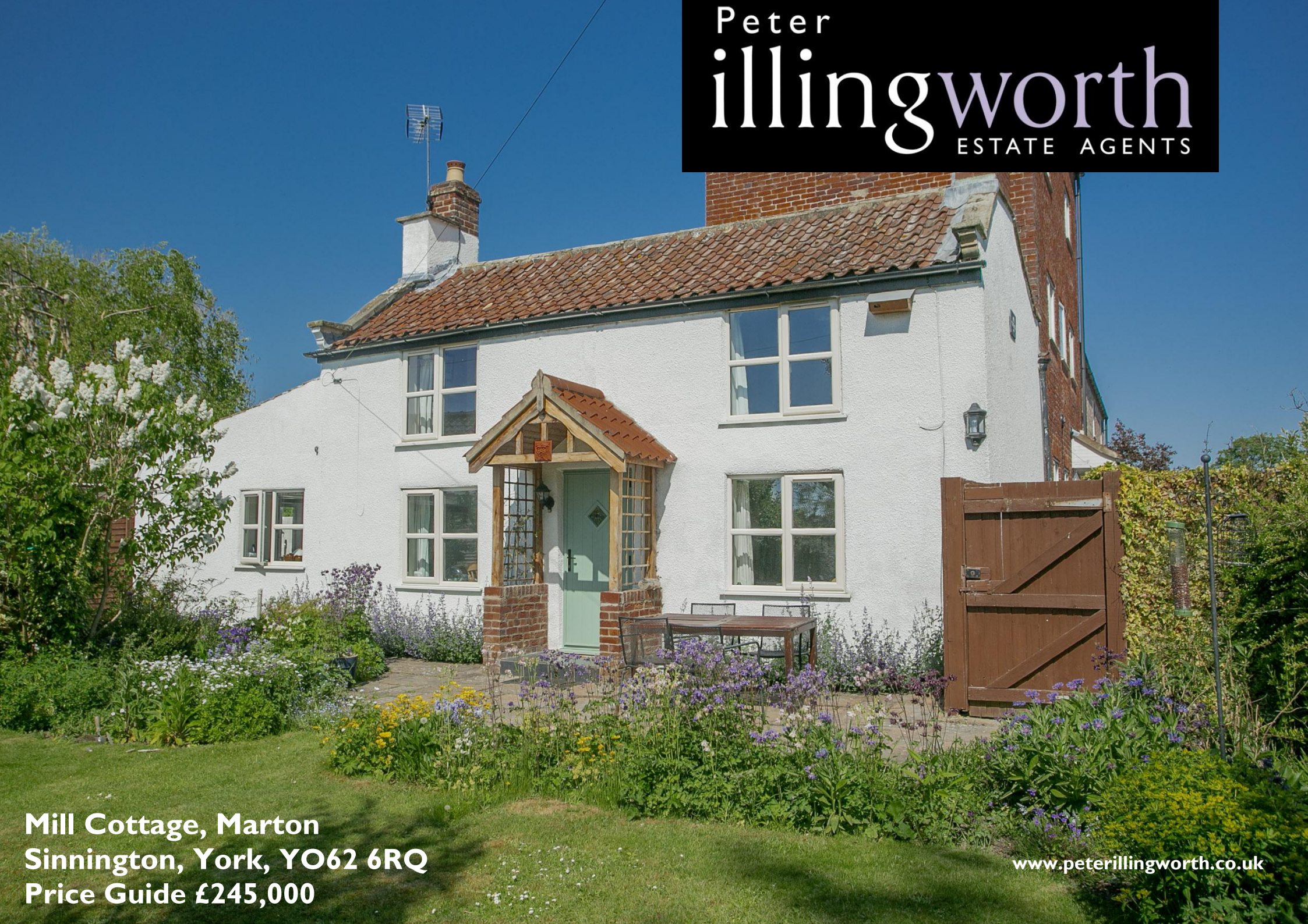
Mill Cottage, Marton Sinnington, York, YO62 6RQ Price Guide £245,000